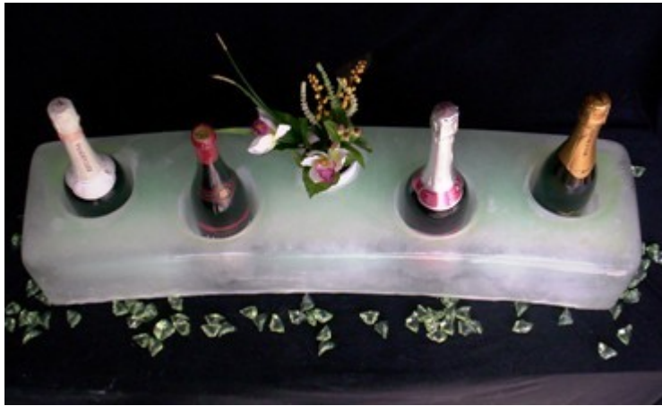
View from top