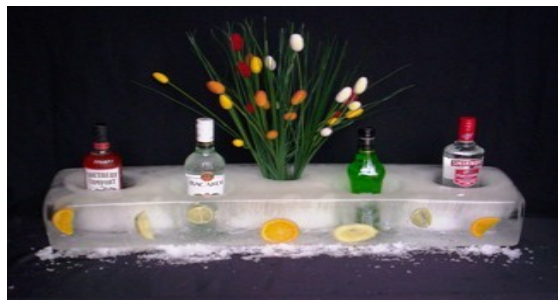
Fruit frozen in the ice