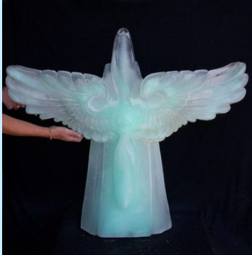
Custom Moulds (above) Maxwell Air Force Base Propellor & Wings Insignia in ice.