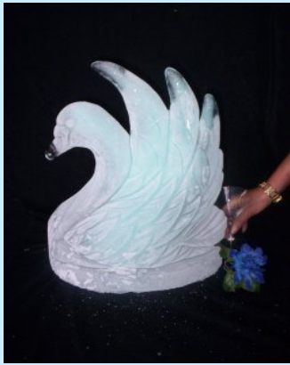
(above) 16" Stylised Swan - Table Centrepiece size

This design now available in 3 sizes – 36", 28" and 16" high.